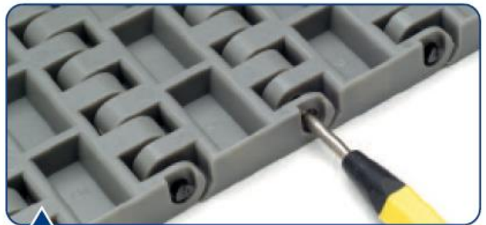
Using a punch opposite the head, tap head and ring out of belt.

Replace all removed rods as they will be damaged during disassembly.