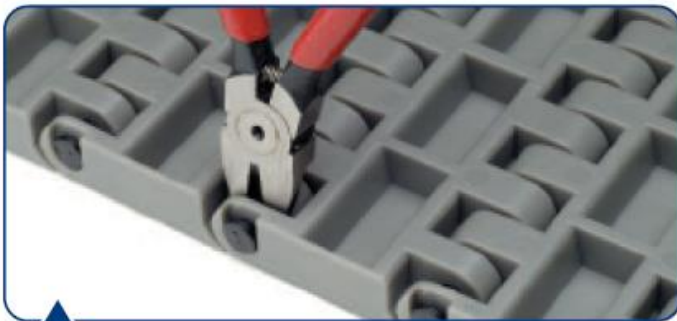
▲ Cut both sides of retainer ring.