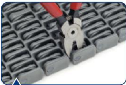
Cut both sides of retainer ring.