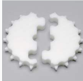
Puzzle split sprocket