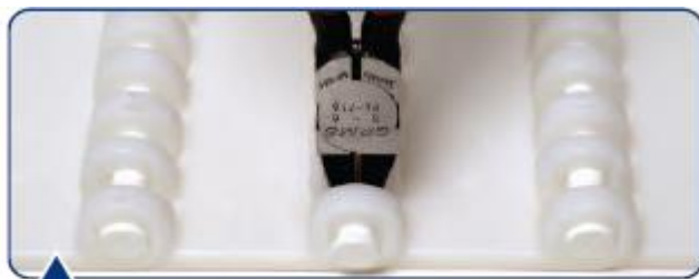
Cutters can be used to pry out the headed rod. After this, use a pin to push out the remaining rod.

Replace all removed rods as they will be damaged during disassembly.