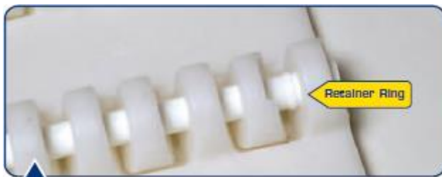
Use a gate cutter to cut the end rod on both sides of the retainer ring, just inside the first finger. (First cut the "inner side," and then cut the "outer finger" side.)