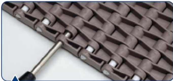
Using a punch from the same end of swedge, punch swedge through the belt.