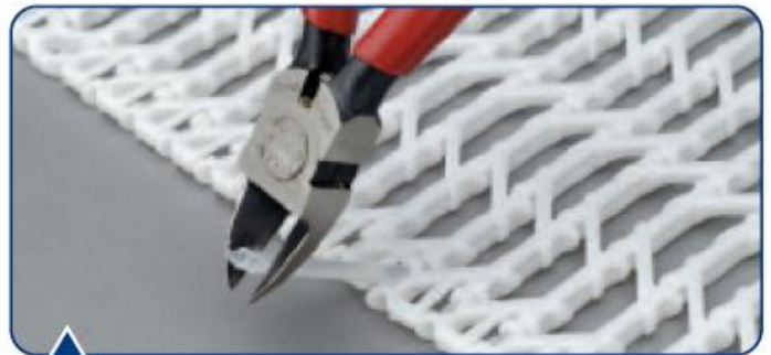
The rod will protrude on the opposite end. Pull on the exposed rod to draw the swedge head through the belt to disassemble.

Replace all removed rods as they will be damaged during disassembly.